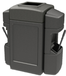
Aruba 2, Double-Sided Windshield Service Center Capacity: 42-Gallon Item # 75990399

See back side for all design options, item #'s, and colors.