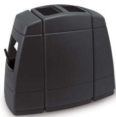
Haven 2, Double-Sided Windshield Service Center Capacity: 55-Gallon Item # 75820199