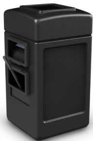
Harbor 1, Windshield Service Center Capacity: 28-Gallon Item # 755101