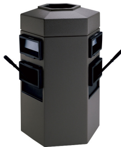
Bermuda 2, Double-Sided Windshield Service Center Capacity: 35-Gallon Item # 755424