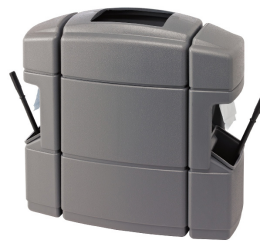
Waste 'N Wipe Double-Sided Capacity: 40-Gallon Item # 758703